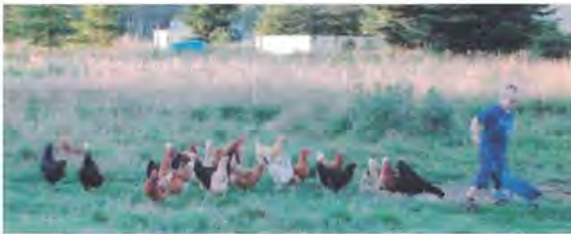
These happy hens at Misty Meadows Farm in Washington produce eggs with 27 times more omega-3 fatty acids than conventional eggs!