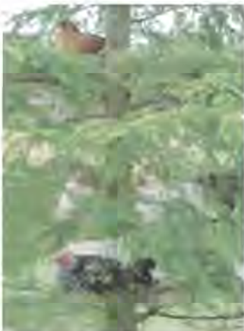
Left to their own devices, chickens prefer not to roost in cramped, steel battery cages.

The conventional egg industry wants very much to deny that free-range/pastured eggs are better than eggs from birds kept in crowded, inhumane indoor conditions. A statement on the American Egg Board’s Web site ( www.aeb.org ) says “True free-range eggs are those produced by hens raised outdoors or that have daily access to the outdoors.”