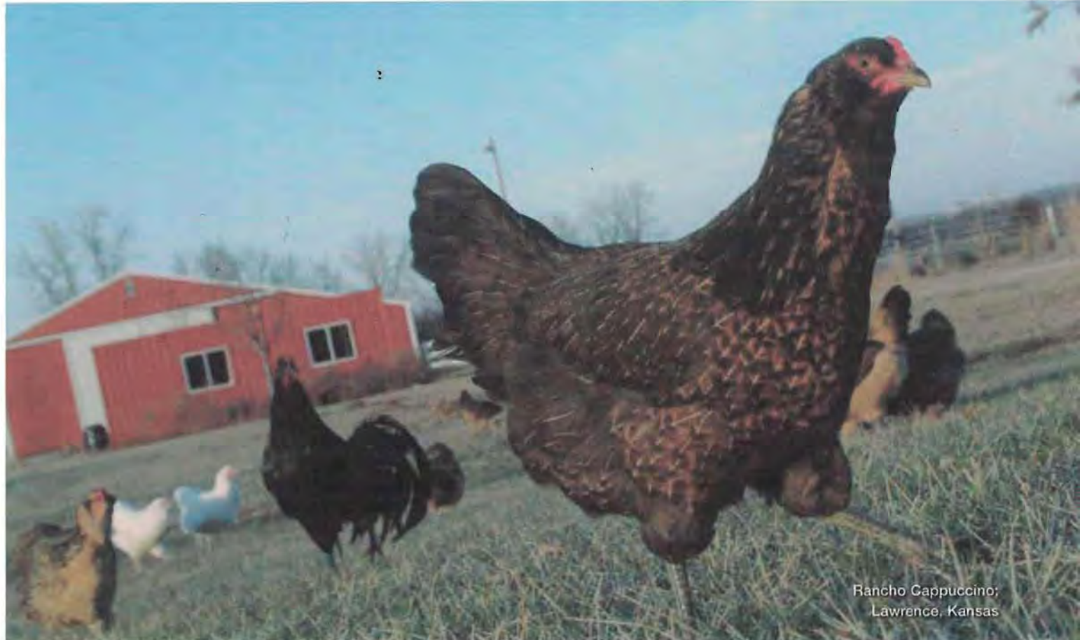
Rancho Cappuccino; Lawrence, Kansas